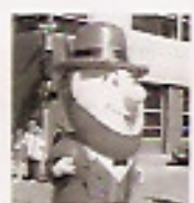
Even the Little Irish Altie Leprechaun was larger than life on parade day